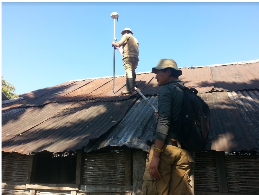
Survey team demarcating Jomotshangkha LAP

Jomotshangkha is one of the oldest satellite towns in Samdrupjongkhar Dzongkhag sharing international border with Indian States of Assam and Aru-