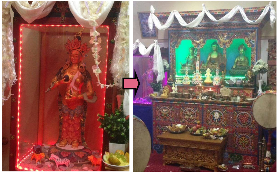
(Left) The Goddess of land (Sayi Lhamo) of the shrine room (Chosham)

On 8 th December, 2016 Venerable Gyetshog Lopen Rinpoche and monks of Zhung Dratshang consecrated office Chosham (shrine room). Chosham in Bhutan is a room dedicated for prayers and daily observance where images and statues of Buddha stand. Besides the statues of Cho Long Trul Sum, the Deity of land Sayi Lhamo (Bhumi Devi) stands in the Chosham symbolizing the organization's mandates of securing land of the Bhutanese.