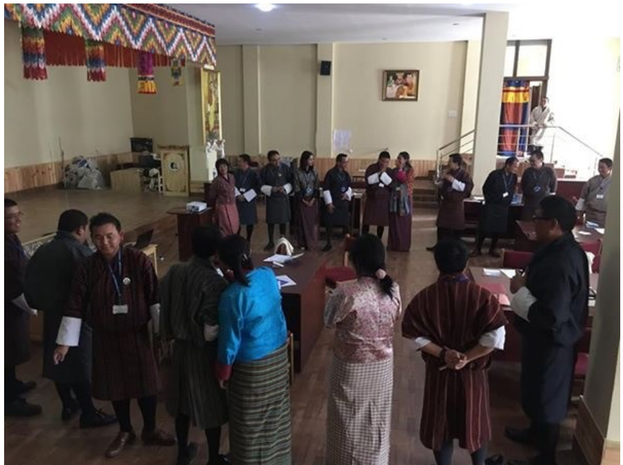
Participants learning how communication skills matter in life

A 5 day training on the Art of Communication, Presentation and Public Speaking was conducted by Institute of Management Studies Ltd. (IMSL) for 20 members of NLCS comprising of Land Registrars, Survey Engineers and Survey Associates. The program covered a range of essential concepts for understanding arts of communication and public speaking. The training was delivered in view of the following learning outcomes: