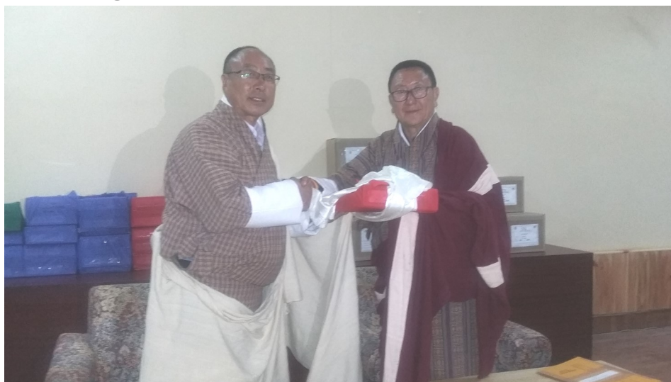
The NLC Secretary handing over New Lagthrams to Thimphu Dzongdag

In commemoration of the 10 th year of His Majesty The King's golden reign, 4,040 Chazhag Sathram and Lagthrams out of 4,480 total thramholders were handed over to Thimphu Dzongdag. Remaining 440 thrams were not issued due to incomplete documents (due to absentees during NCRP, dispute etc.)