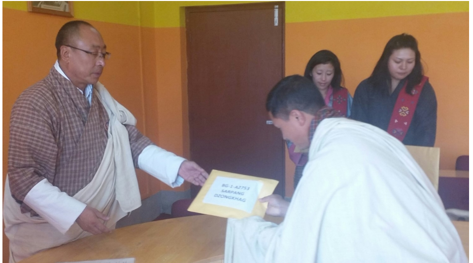
Secretary handing over keys of vehicles to Dzongkhag Land Registrars

Every year there is increase in-land transaction and land fragmentation cases . As a result Land Record Officials and surveyors have to undertake field verification surveys. Surveyors used to carry heavy survey equipment to the field in the past. However, Surveyors can now transport survey equipment to every gewog as most of the gewogs are connected with gewog roads. It was timely to pro-