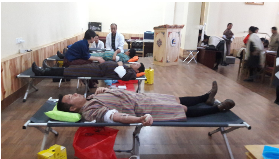
NLCS staff taking their turn for blood donation

Towards saving life of the people the NLCS staff voluntarily donated blood to Jigme Dorji Wangchuck National Referral