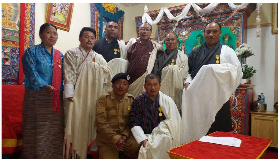
Recipients of Civil Service award with the Secretary

In accordance with the Civil Service Rules and Regulations 2012 the staff who served for more than 10, 20 and 30 years were awarded the Civil Service Award certificate and medal of Bronze, Silver and Gold respectively.