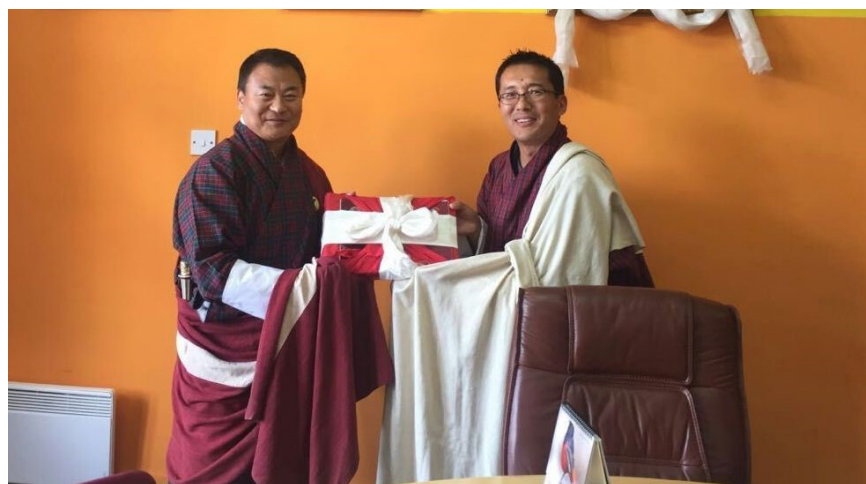
The Director handing over New Lagthrams to Samtse Dzongkhag

The Secretariat handed over 8570 rural lagthrams for plots without the issue of excess/