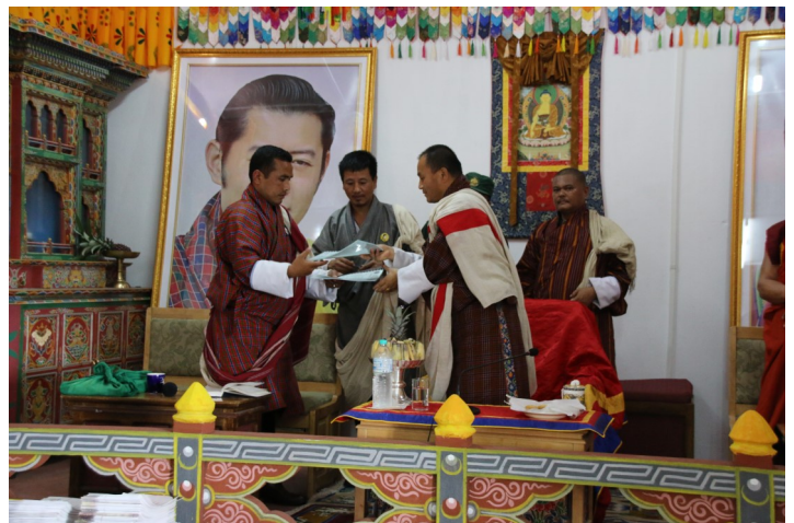
Samtse Dzongrab distributing Lagthrams to the people of Tashichholing gewog, Tashichholing Drungkhag