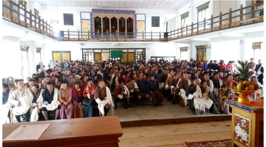
Dzongkhag Administration issued Lagthrams to the landowners of Paro

Landowners will have to approach respective gewog offices and collect their Lagthrams on payment of a minimal fee of Nu. 50.