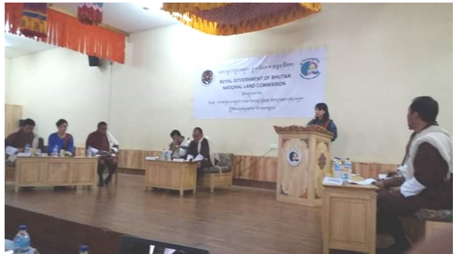
Participants of Dzongkha Debate Competition

Dzongkha as a spoken language has lost its purity, meaning people tend to mix