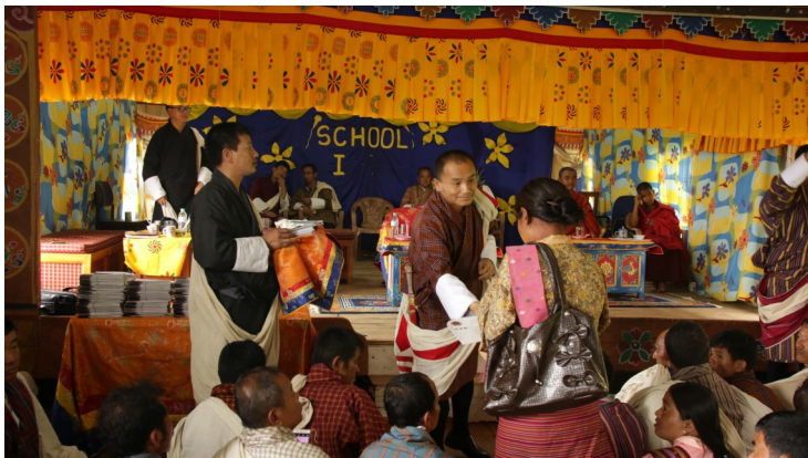
People of Norboogang gewog under Samtse Dzonkghag gathered for collection of Lagthrams