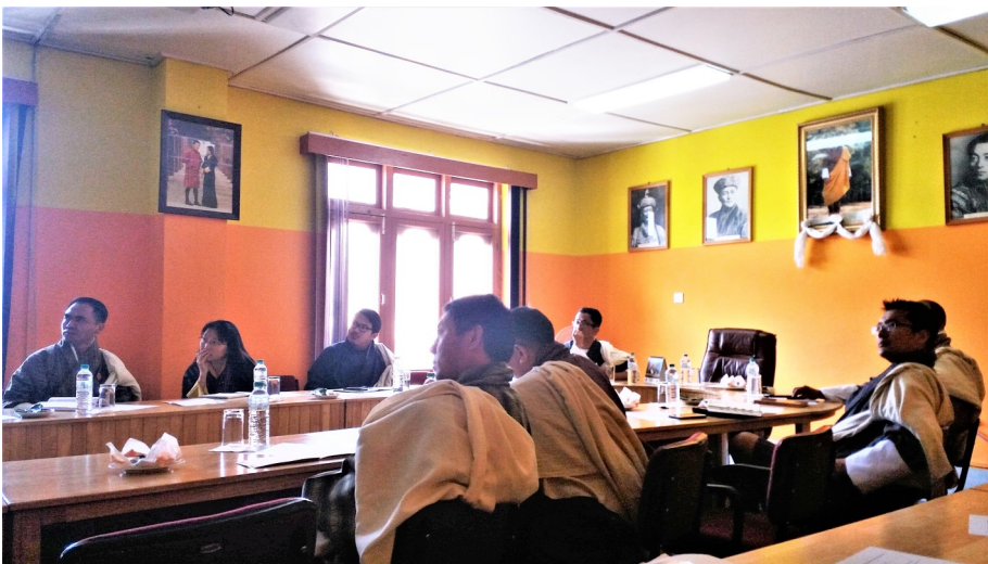
Members of High Level Committee consultation meeting

A High-Level Consultation meeting on “National Land Use Zoning” was held on 1st May, 2017. The meeting was chaired by the Secretary of Gross National Happiness Commission.