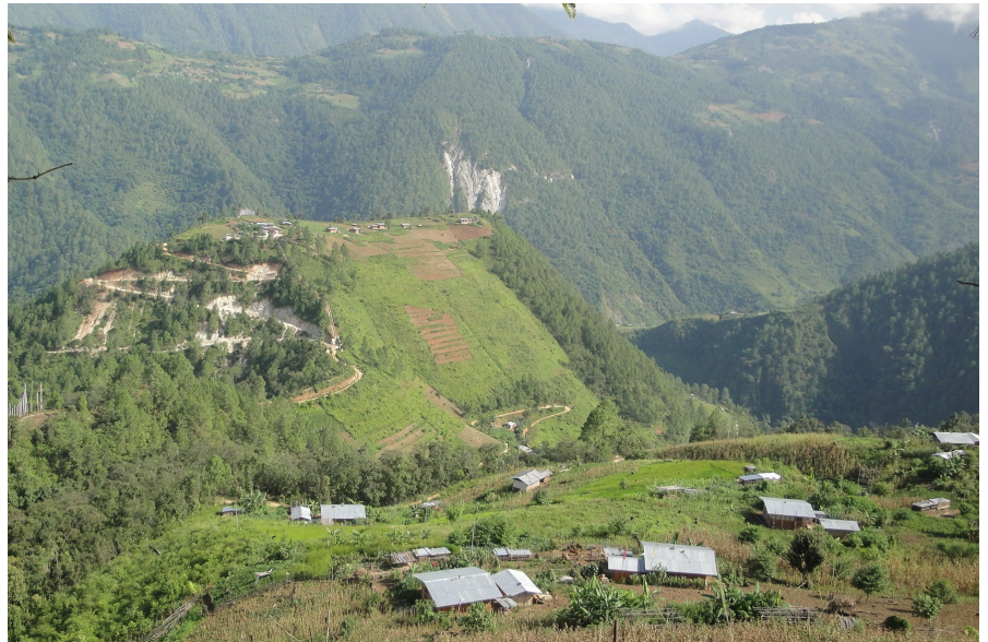
View of Khenadang rehabilitation project site

His Royal Highness Gyaltshab Jigme Dorji Wangchuck, inaugurated the Khenadang rehabilitation project in Pemagatshel on 28 th October, 2014, which provides a new home to 44 households along with amenities and other services.