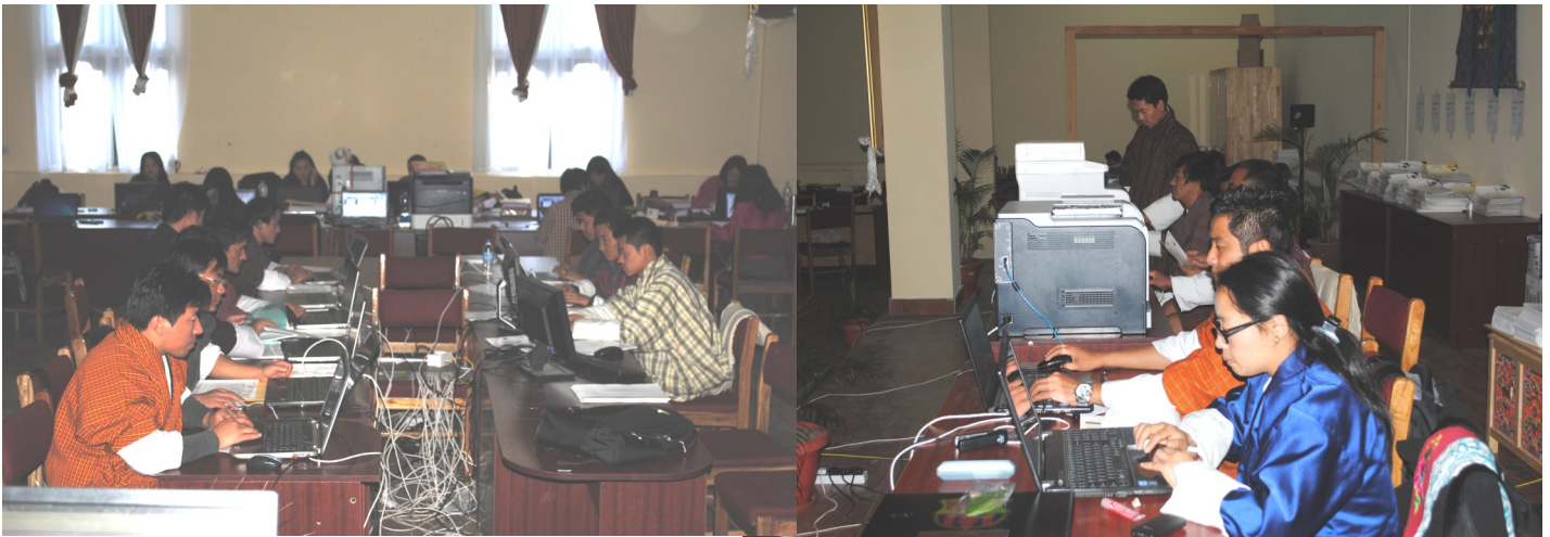
Survey Engineers and Surveyors involved in Lagthram production check cadastral maps of plots, clean data, monitor printing of maps for every land parcel registered in the individual Thram.

The NLCS is hopeful that thram production for all other remaining dzongkhags is expected to complete by end of February 2015.