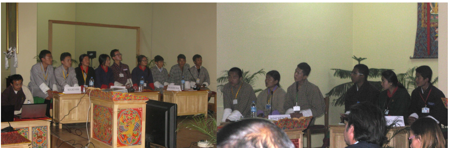
From left: Students of Kelki HSS, Motithang HSS, Pelkhil HSS, Rinchen HSS and Yangchenphu HSS actively participating in the inter-school quiz competition organized by Centre for GIS Coordination with support of UNDP, ICIMOD, ESRI, Hexagon and Druk Mapcon Services

ondary School scored the highest point and stood first followed by Kelki Higher Secondary and Pelkhil Higher Secondary School in the third position. UNDP, ICIMOD, ESRI, Hexagon and Druk Mapcon Services also supported the quiz competition.