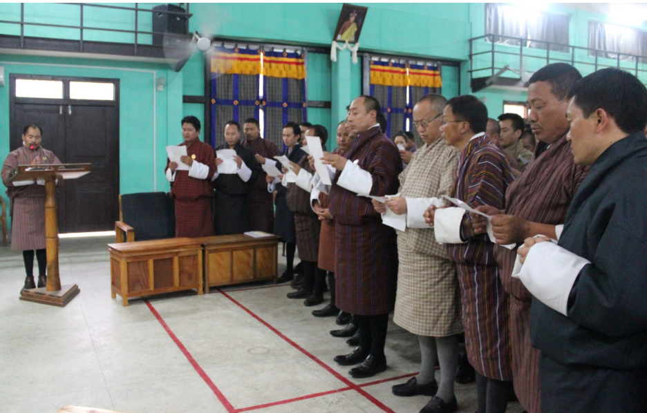
In commemoration of the 60th Birth Anniversary of the 4th Druk Gyalpo Jigme Singye Wangchuck, the 3 rd NLC Annual Conference ended with the recitation of Zhabten (Long Life prayers).