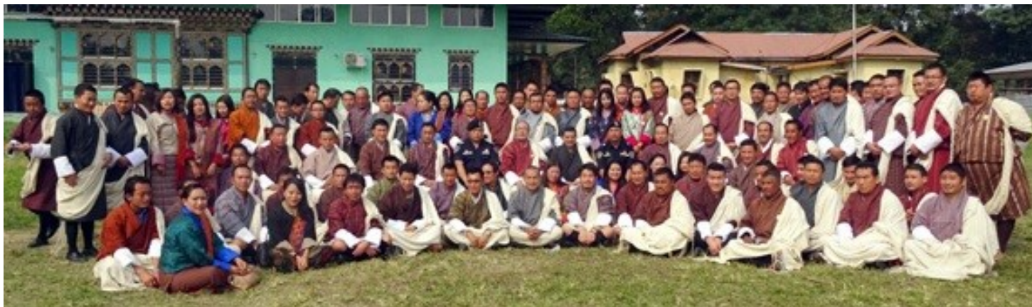
Group photo with participants of 20 dzongkhags, 15 Drungkhags and 4 Gyalong Thromdes

The 3 rd annual conference of the NLCS was organized at Gelephu Middle Secondary School, Gelephu from 13 th till 15 th November 2014 on the theme “ in pursuit of effective and efficient land governance ”.