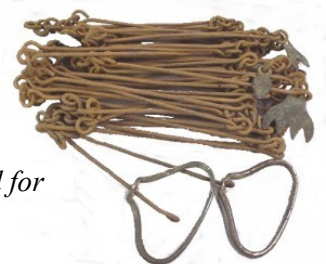
Chain used for surveying

10 square chains (5 chains X 2 chains) equal to 1 acre. Towards the end of chain survey proper land records compiled were known as Acre Zindre Thram.