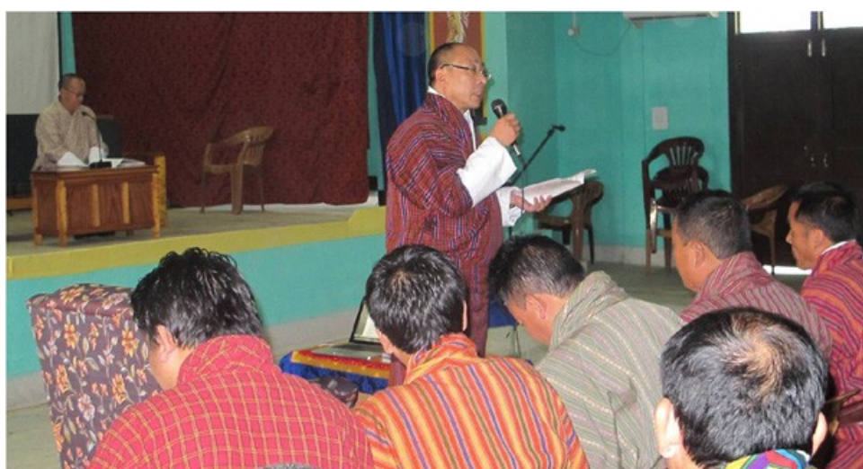
The Secretary responding to the questions raised by the participants

the officials also discussed some of the land issues deemed essential such as land substitution, land exchange and land conveyance. It was understood that these were some of the services which have direct impact on the general public and there was consensus among all the Land Record Officer from Dzongkhags that these services will be prioritized.