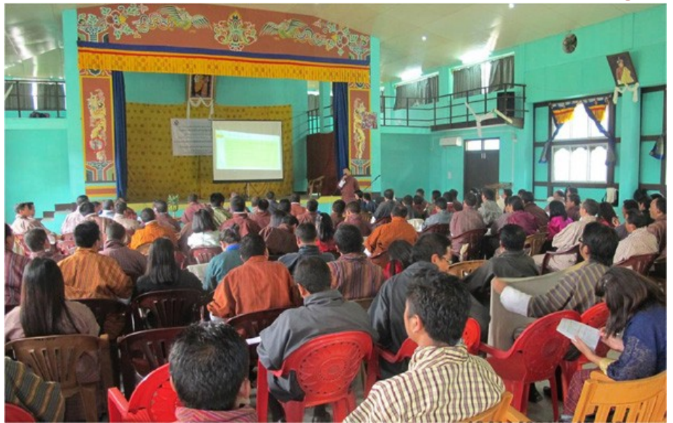
Presentation and discussions during the 3 rd Annual Conference.