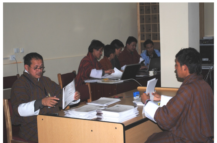
Assistants binding thram pages and corresponding plot maps into a Thram