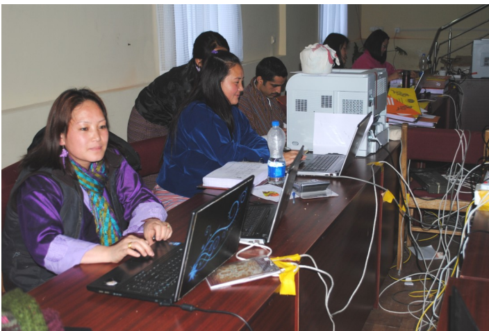
Land Registrars and Land Record Assistants preparing and printing Thrams