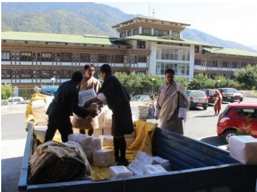
Officials help loading of Trashigang Thrams on a DCM Truck