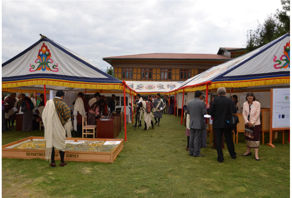
GIS Expo was held at NLCS lawn

After launching the geo portal Her Majesty the Gyaltsuen also graced opening of the National Geo-information Expo where more than 20 national and international stakeholders showcased information related to Earth. The Expo was jointly organized by the Centre for GIS Coordination, National Land Commission and ICIMOD supported by UNDP, HEXAGON, INTEGRAPH and LEICA.