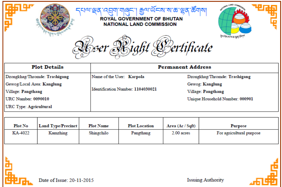
Sample of User Right Certificate

The NLCS has introduced "Friday Forum" a platform to develop presentation skills and public speaking of the staff. The first round of Friday Forum has been completed with 5 speakers on every Friday where staff