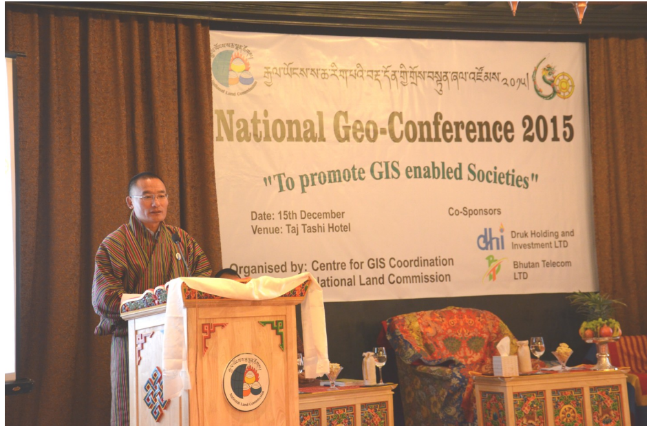
Hon'ble Prime Minister addressing Conference

He also stated that, to ensure true commitments, such as being carbon neutral for all times to come, we must make sure we do proper planning. He said “Also to improve agriculture and