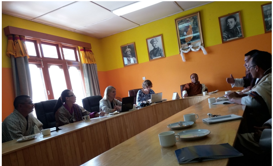
Members of CGISC attending the project closing meeting

The technical assistance project focused on NLC, MoWHS, Thimphu Thromde and Bhutan Power Corporation in the field of land governance and geographic information system. The project was implemented by Kadaster International of the Netherlands and Bhutan's Centre for GIS Coordination, in partnership with