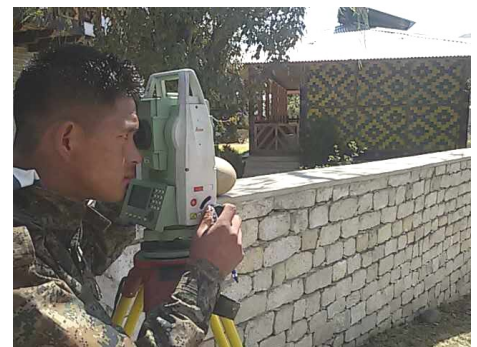
Army personnel handling Total Station

owners during the first NCRP, and verification of kasho land area. A total of 148 Thram holders’ kasho land area were verified and carved out total of 9.753 acres as excess land. In the process, pending thrams were updated and resolved some dispute cases.