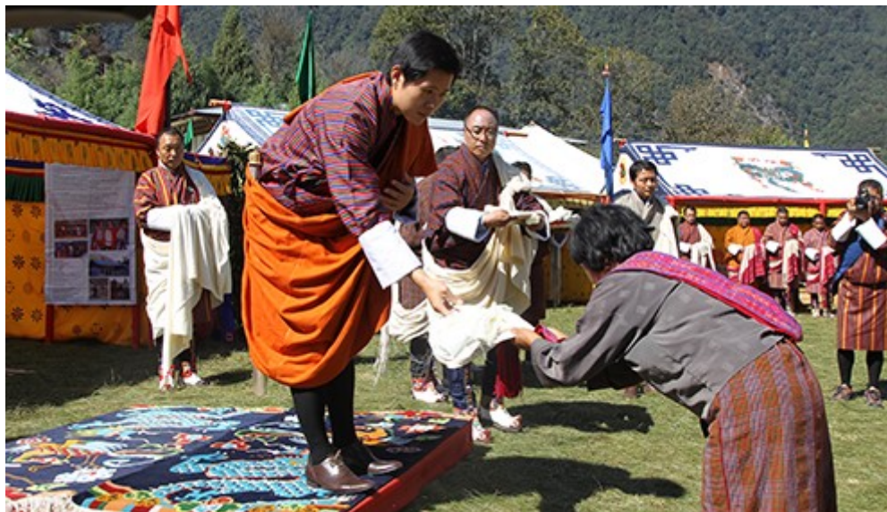
The beneficiaries receiving Lagthrams from His Royal Highness

His Royal Highness, Gyaltshab Jigme Dorji Wangchuck graced the inauguration of Ney rehabilitation project site on 1st November, 2015 coinciding with the coronation day of His Majesty the King. The event was dedicated to commemorating the 60th birth anniversary of the 4th Druk Gyalpo.