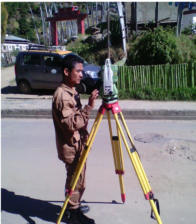
A Surveyor surveying a plot near Zangdopelri Lhakhang behind Changlam Square

There are 23 plots with structures encroaching onto state