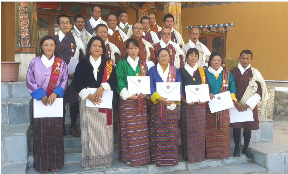
Recipient of Civil Service Award of NLCS