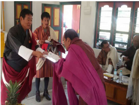
Samtse Dzungda handing over Lag Thram to landowners