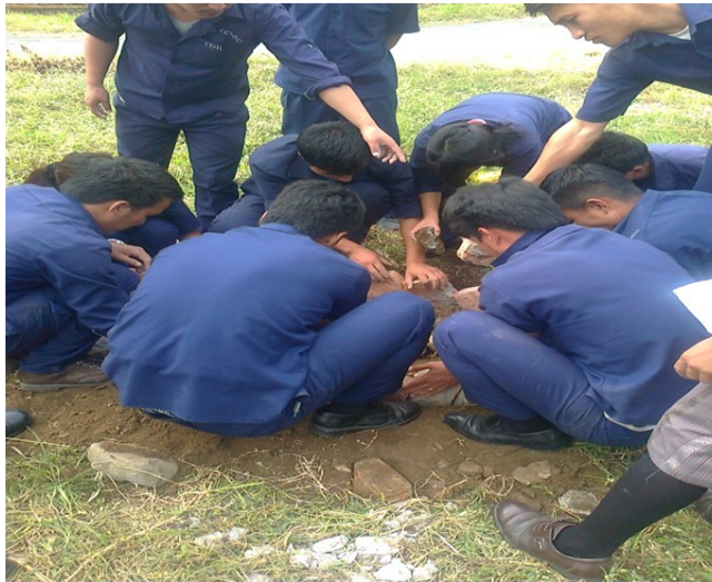
Trainees marking hill station position for GNSS Observation

Jigme Namgyel Engineering College, Dewathang had introduced a new course Diploma in Surveying from mid 2014. MoU was signed between National Land Commission (NLC) and JNEC on exchange of technical expertise in surveying. The College invited staff of NLCS as guest lecturer to teach 2nd Year Trainees of Diploma in Surveying.