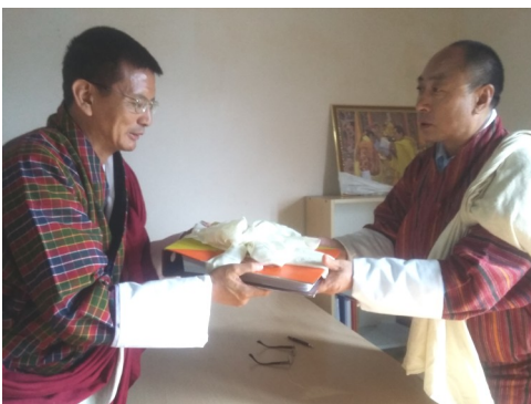
NLC Secretary handing over new Lagthrams to Chukha Dzongdag

1. Chuukha Dzongkhag: The Secretary of National Land Commission handed over 9785 Lagthrams for 11 gewogs of Chukha Dzongkhag to Dzongda on 16 th October, 2015 .