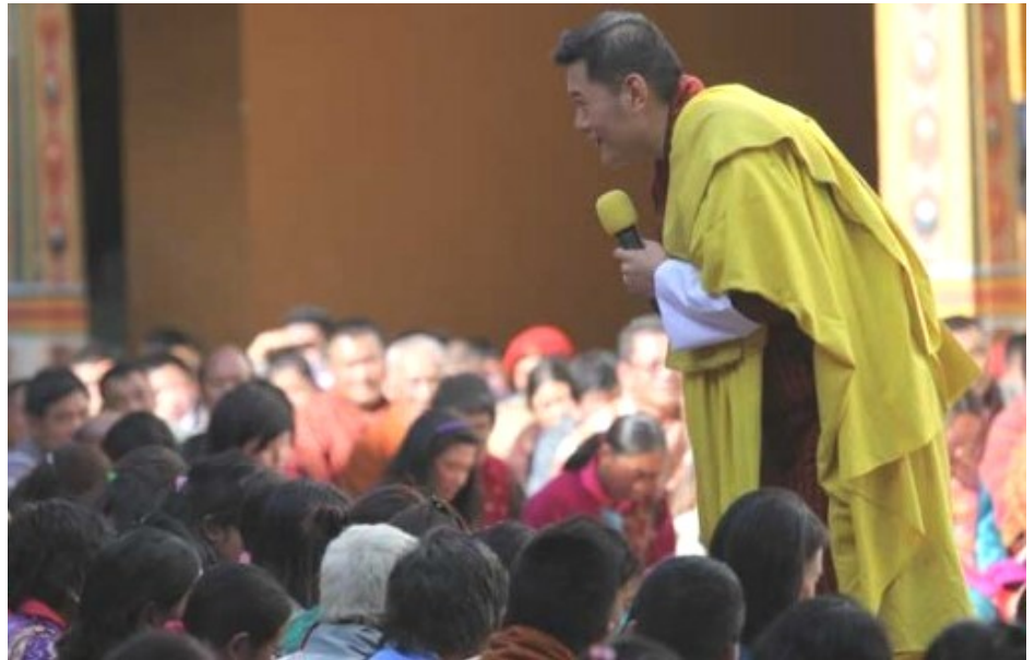
His Majesty The King interacting with the people of Chukha Dzongkhag

His Majesty the King granted 8,143.34 acres of land as kidu to 7011 thram holders of Chukha dzongkhag on 15th October 2015, which is the 14th Dzongkhag where land kidu