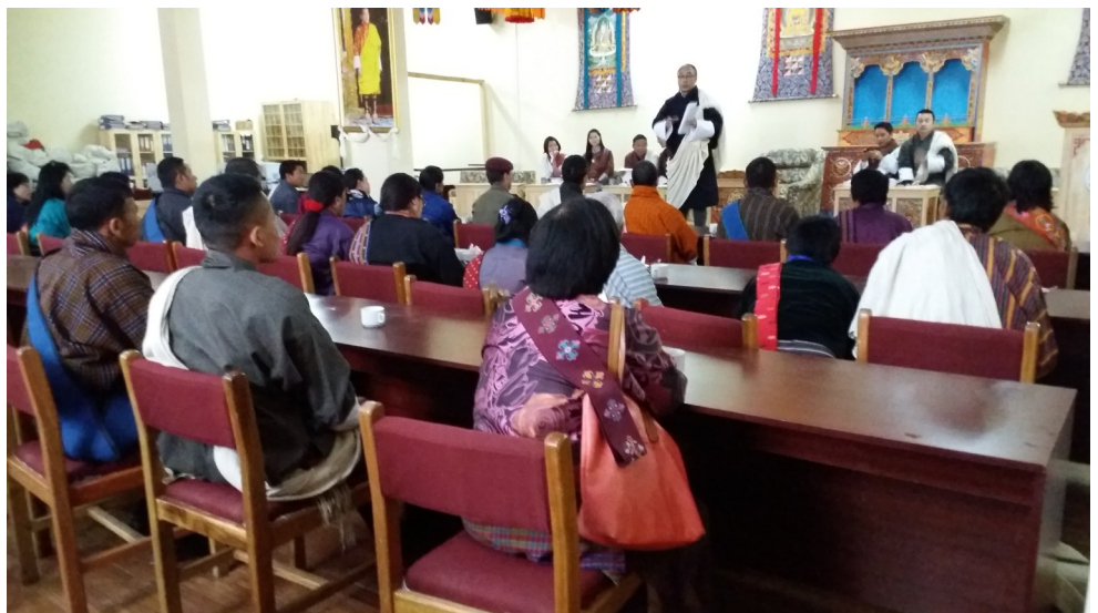
Kidu beneficiaries gathered to receive lagthrams and User Right Certificattes