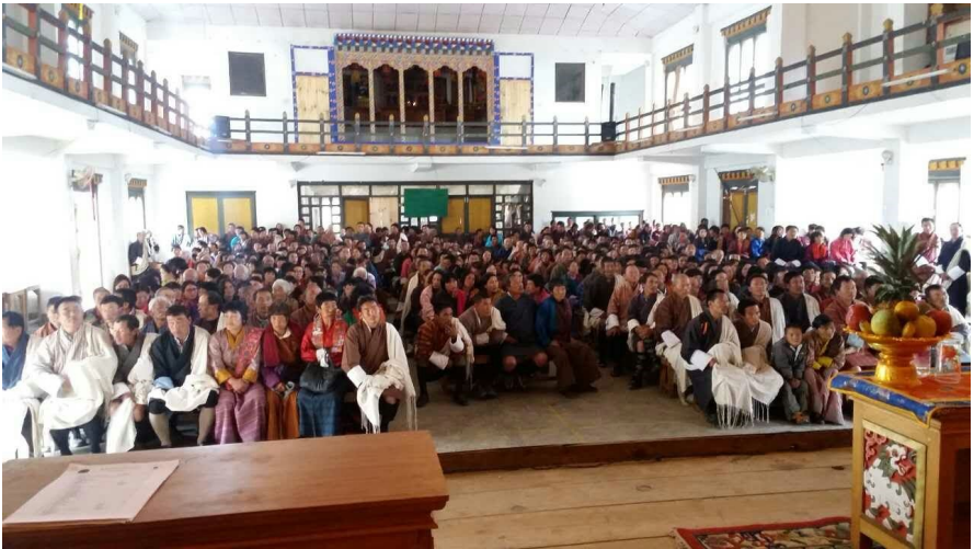
Dzongkhag Administration issued Lagthrams to the landowners of Paro

Landowners will have to approach respective gewog offices and collect their Lagthrams on payment of a minimal fee of Nu. 50.