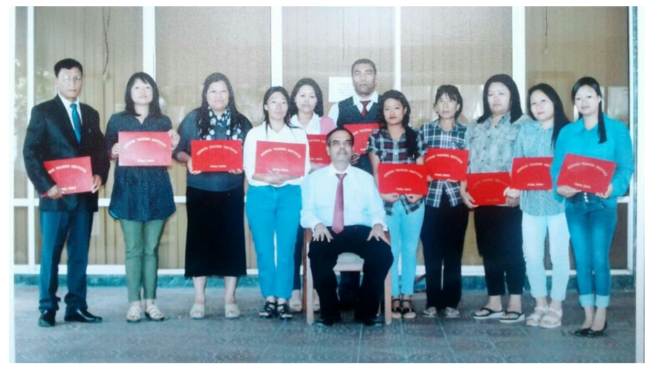
Participants of Customer Care & General Office Management Training

Human resource development program is aimed at enhancement and development of employees personal and organiza-