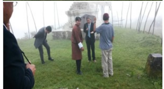
JICA team's site visit to Kamji, Chukha to observe the existing control point and leveling Benchmarks