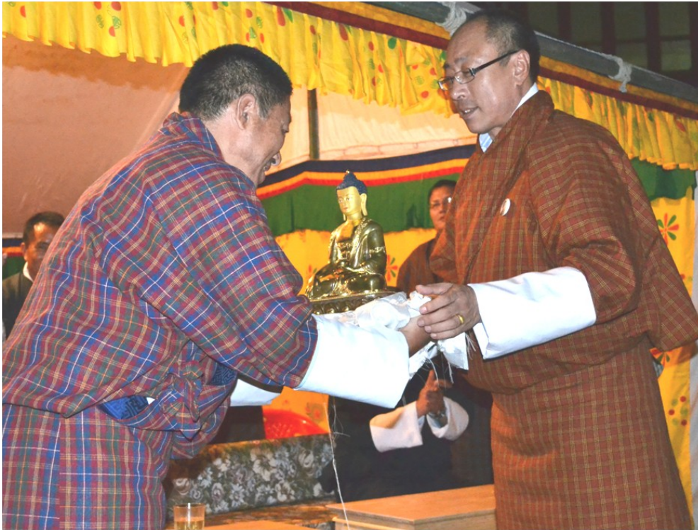
The Secretary, NLC presenting a token of memory on the evening of farewell

He has joined Bhutan Telecom as the new CEO on 1st September 2014. NLCS staff wished him all the best.