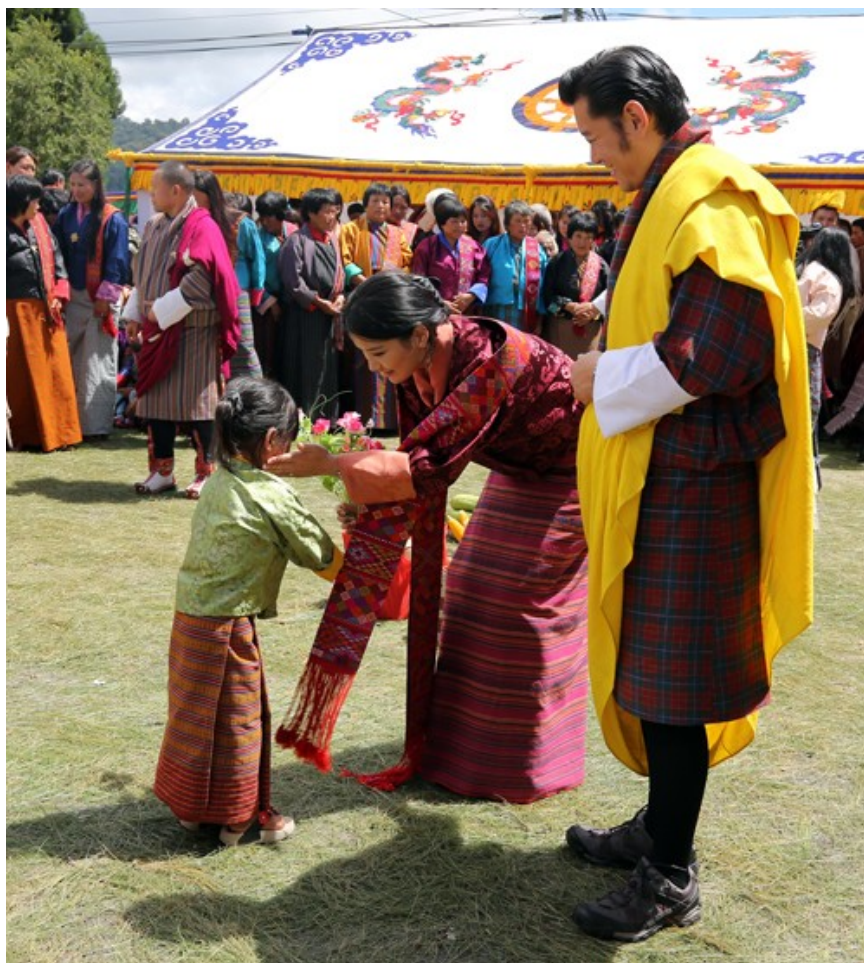
A girl offering flowers to Her Majesty the Gyaltsuen during the public tokha in Zhemgang

His Majesty the King granted land kidu to 6,708 households and land substitutions to 10 households of Zhemgang dzongkhag on 16 th September, 2014. Total area of 11,410.723 acres of land was granted as kidu for excess land and exempted excess cost payment of Nu.158.768 million.