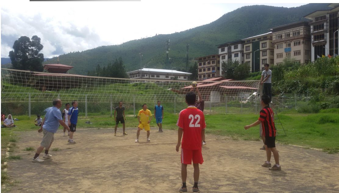
Finding time for recreational activity amidst busy schedule: Intra-pick up Volleyball match amongst NLCS staff at Changlimithang stadium during weekends