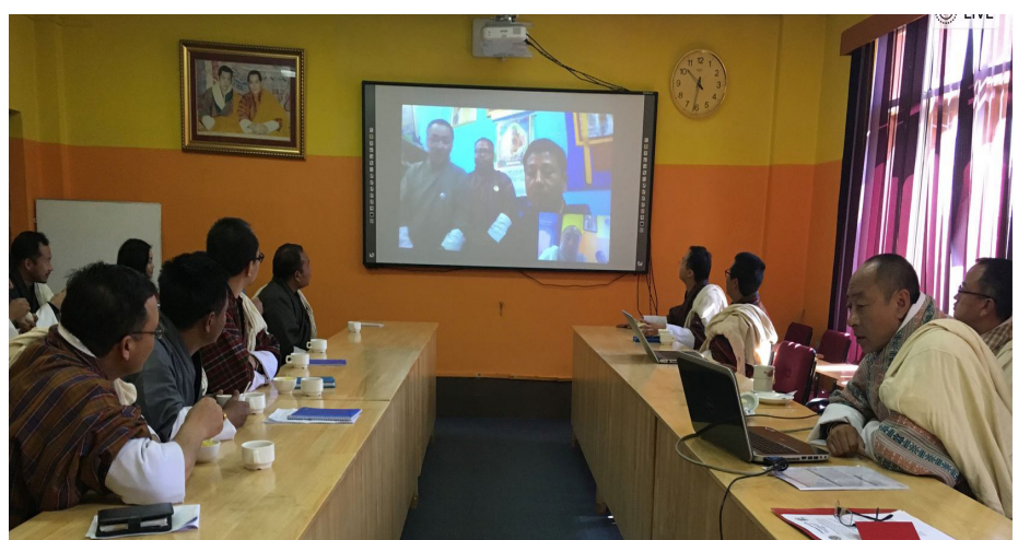
The Secretary interacting with Samtse staff through TrueConf application

However, there is no room for complacency and the NLCS continuously strives to further