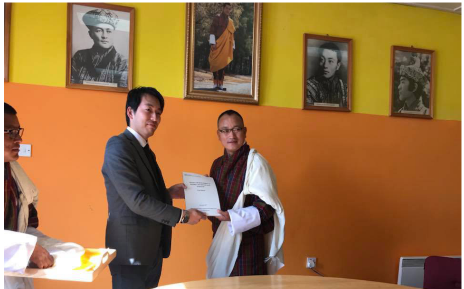
JICA handing over Base map to the Director, Department of Survey & Mapping

JICA Bhutan has handed over topographical base map of 1:25,000 scale covering 11,000sq. km. of eight southern Dzongkhags to NLCS. This large scale base mapping shall replace the existing 1:50,000 scale that was carried out in the early 1960s. Considering the base mapping as a critical component and a prerequisite in restructuring National Spatial Data Infrastructure (NSDI) in the country, JICA has supported the first phase of the project to NLCS with the capacity development and technological transfer modality. The first phase has been successfully completed.