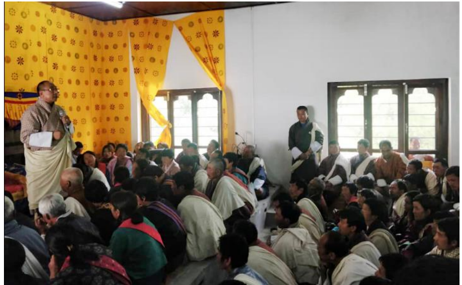
The Secretary, NLC sensitizing on land issues in Naja gewog, Paro

of resolving land issues, it was suggested that Gewog Grievance Committee (GGC) and Dzongkhag Grievance Committee (DGC) be formed to find out the best options and recommendations in resolving land issues. Each Gewog will have to institute a GGC with a resource person each from the NLCS. The surveyors will also have been deployed to carry out the survey