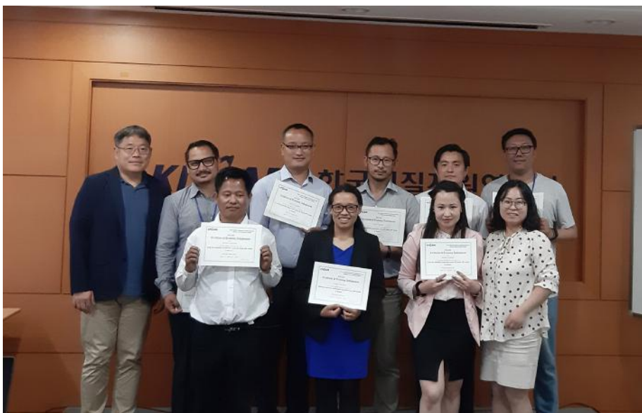
Instructors and participants of MCDA training in KIGMR

Land is the cornerstone of economic and social life both in urban and rural areas. In addition, it is important for Bhutan to preserve our fragile ecology. As there are competing demands on land from different sectors for various purposes the MCDA would be instrumental in implementation of National Land Use Zoning of the entire country delineating different land use zones.